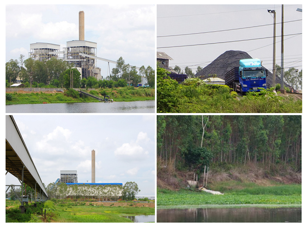
The site of fish sampling, Shalongwaeng Canal, is adjacent to a coal-fired power plant (upper left), an open-air coal storage pile (upper right), a pipeline transporting coal across the canal (bottom left), and a wastewater treatment pond for the paper and pulp mill (bottom right).