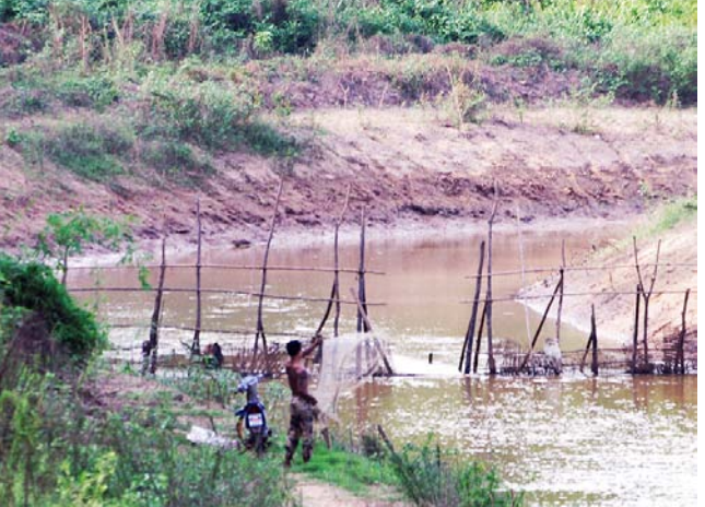
Location of fish sampling is Shalongwaeng Canal, a major source of food for residents who provided hair samples.

Thai NGO, EARTH, conducted fish and hair sampling. Twenty samples of common snakehead were caught in collaboration with local fisherman using protocols developed by the Biodiversity Research Institute (2011). For sampling of human hair, EARTH