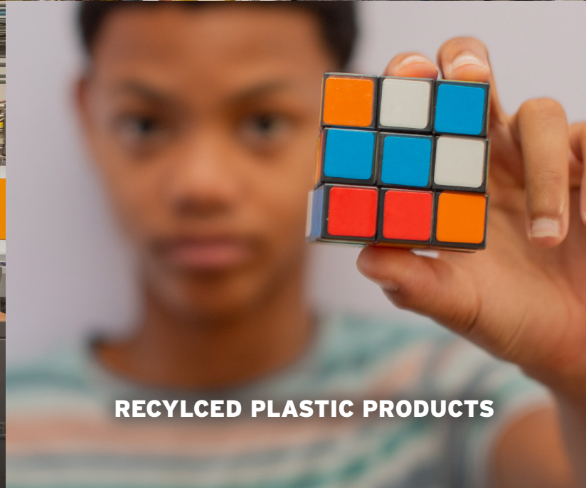
RECYCLED PLASTIC PRODUCTS