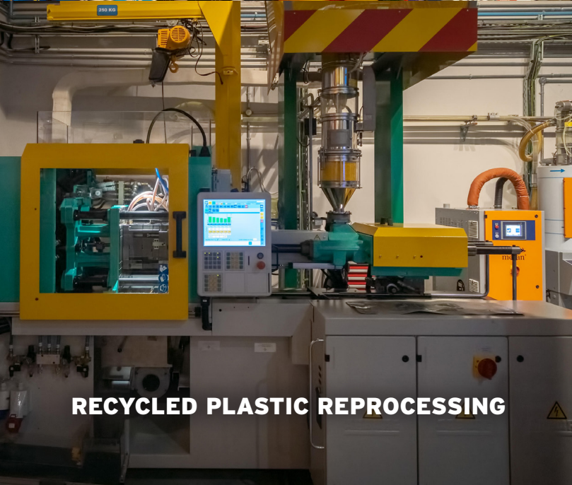
RECYCLED PLASTIC REPROCESSING