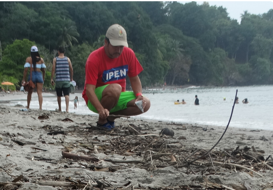
Beach pellet collection in Costa Rica.

The IPEN and IPW study, Plastic pellets found all over the world contain toxic chemicals , examined the presence and concentration of two groups of toxic chemicals in beach pellets in over 20 countries. Beach pellets are pre-production pellets