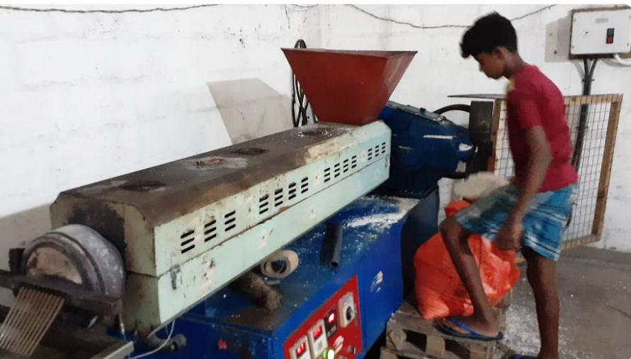
Shredded plastic waste being recycled into plastic pellets in Sri Lanka.

Some countries are pursuing plastics recycling as one option for dealing with large amounts of waste generated each year, however, collection and recycling rates have remained an obstacle. Further, policy makers should be concerned about the toxic nature of plastics, and the fact that chemical additives do not need to be labelled or monitored throughout the supply chain.