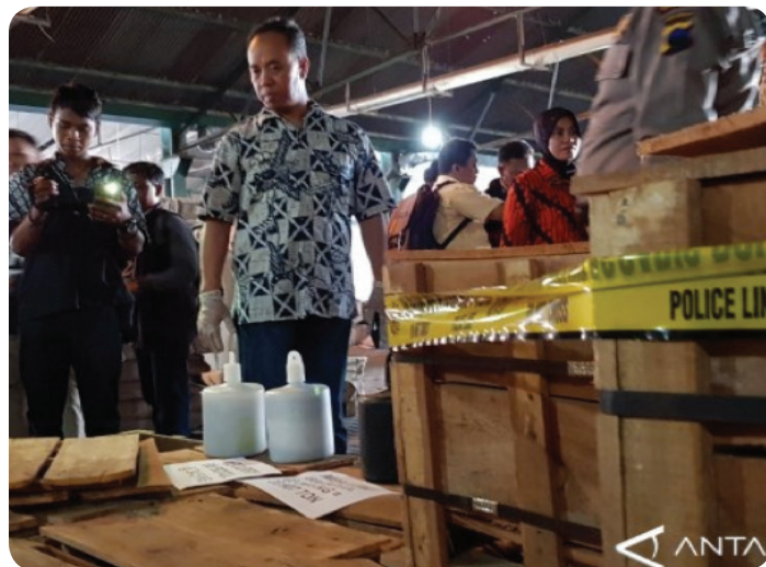
Figure 3 (left). Many women processing gold using mercury at ASGM sites bring their babies to the processing facilities. Figure 4 (right). Indonesian police in Semarang, Central Java, confiscated 20.9 tons of mercury from a warehouse rented by a Sudanese buyer. The buyer and the warehouse owner were sentenced to jail and fined, but the mercury trader from Bekasi was never caught.

The NAP requires strategies to prevent foreign and domestic supplies of mercury being diverted into ASGM, thereby providing a mechanism to restrict mercury supply that is not controlled under primary mining or chlor-alkali closure provisions of the Treaty.