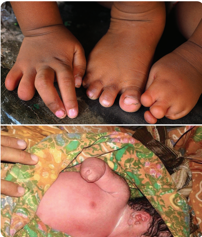
Figure 2. Baby and children with birth defects in ASGM hotspots of Indonesia.

The Mercury Treaty contains provisions under Article 7 and Annex C requiring Parties who have an ASGM sector to send a notification to the Secretariat stating that the ASGM situation in their respective countries is “more than insignificant” and to develop a National Action Plan (NAP) to address and reduce the use of mercury in ASGM.