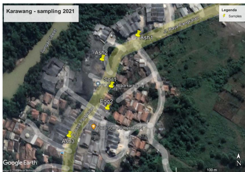
Figure 1: Map with group of samples in the middle of lime kilns concentrated around the road, locality Karawang II.

The identification and quantification of PBDEs were performed using gas chromatography coupled with mass spectrometry in negative ion chemical ionisation mode (GC-MS-NICI). The identification and quantification of HBCD isomers and selected PFASs were performed by liquid chromatography interfaced with tandem mass spectrometry with electrospray ionisation in negative mode (UHPLC-MS/MS-ESI).