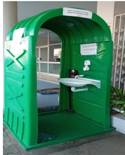
Picture 6. Tunnel at entrance of the Ministry of Health