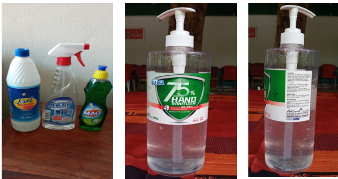
Picture 4. Bleach, dishwasher liquid, gel hand sanitizer