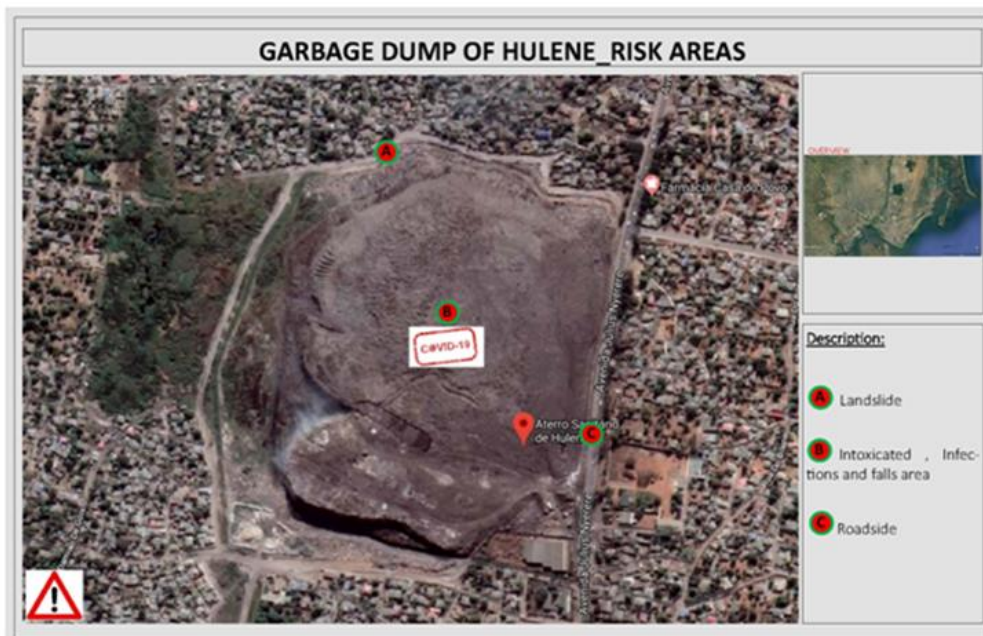
Picture 1. Dumpsite risk area for COVID-19 wastes