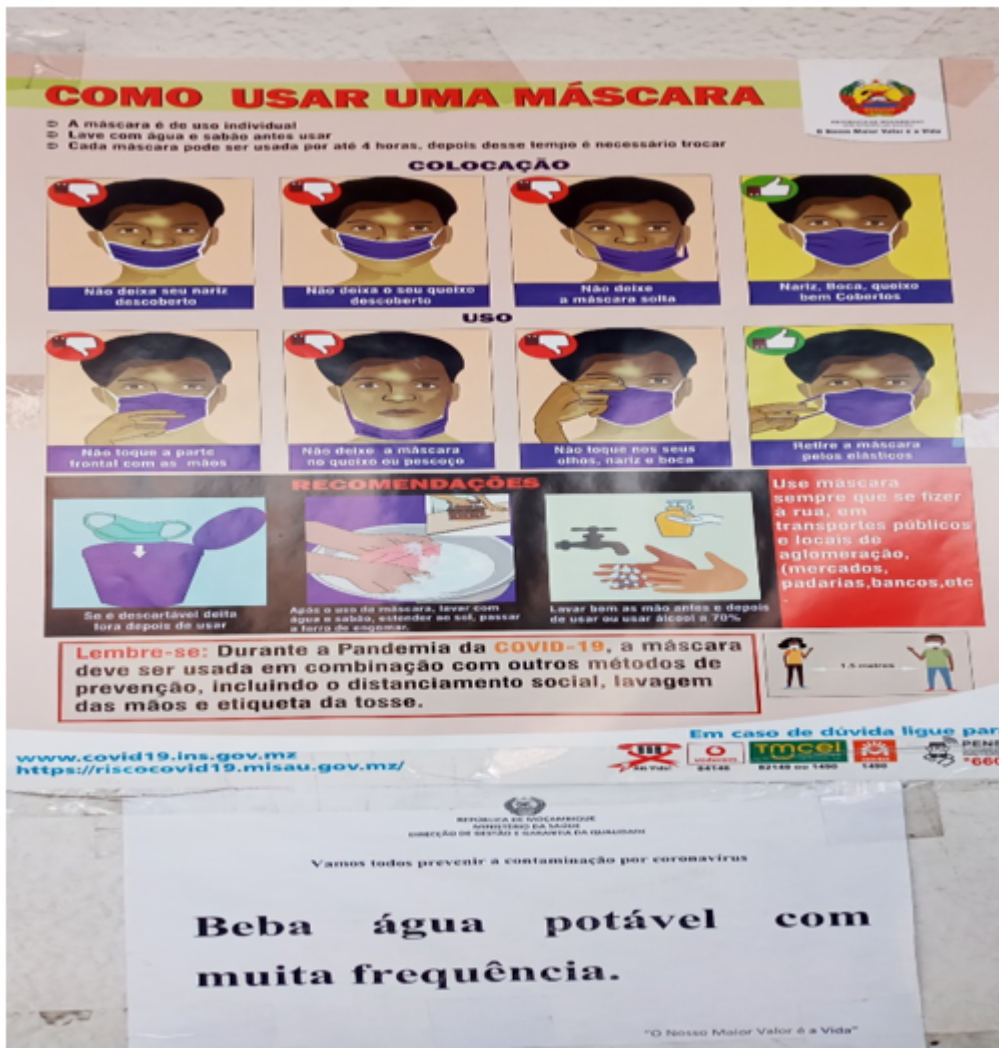
Picture 2. Instructions for use of masks