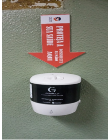
Picture 5. Hand washing soap and gel sanitizer at the supermarket and restaurant