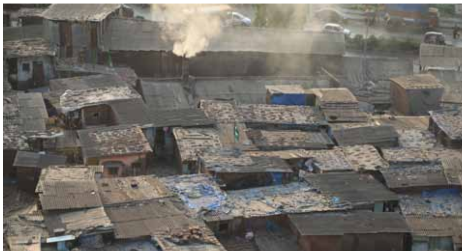
Asbestos containing roofing materials

The Convention does not ban trade of hazardous substances. On the other hand, by ratifying the Convention, countries, which export a hazardous substance, make a commitment, under an international, legally binding Convention, to fulfill the obligations that the Convention imposes on exporting countries. Exporting countries have a legal and moral duty to respect – and not to block - the right of Prior Informed