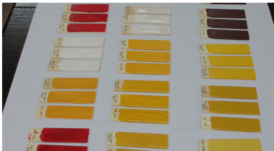
Figure 2. Preparation of Paint Samples.

assurance testing. This was made by sending paint samples with a known lead content to the lab, and evaluate the results received.