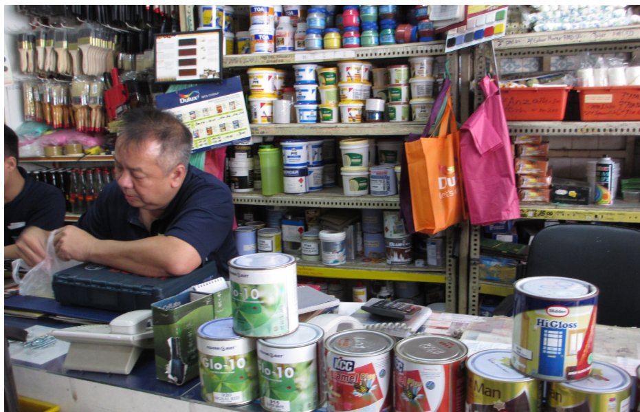
Figure 1. Household Enamel Paints Purchased in Malaysia.

nate Lead Paint (GAELP), an international coalition, which works towards the phasing out of lead paint. Furthermore, Malaysia's measure on children's toys provides only partial protection as it does not address domestic paints, which are the paints most likely to contribute to childhood lead exposure.