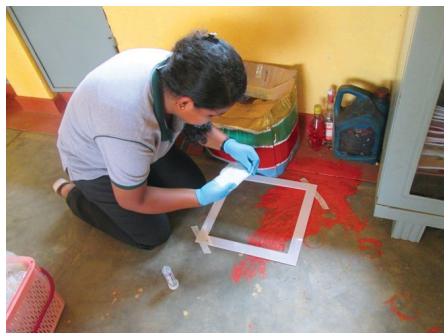
Taking dust samples at a Sri Lankan school.

Scientific studies performed over the last decades show that dust lead loadings as low as 10 g/ft 2 can contribute to blood lead levels harmful to the developing brain (see e.g. Lanphear, et al., 1998; Dixon, et al., 2009).