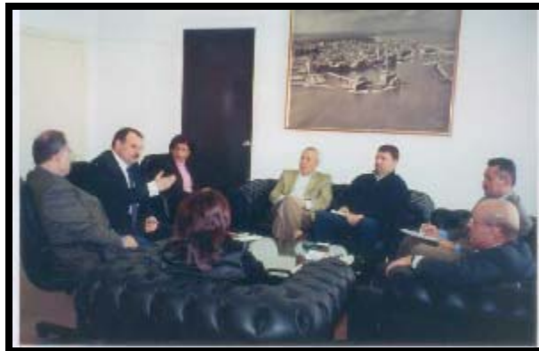
Preparatory meetings with NIP members & Ministry of Environment