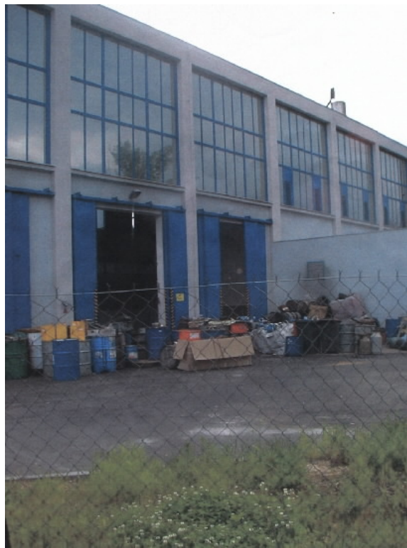
Picture 6: Sampling site of the sample No. 3494 and of several soil samples taken by Arnika as well as by others (see resources for soil sampling in text).