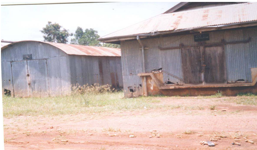
Iron-walled stores for obsolete chemicals at KARI

In the 1980s, the Government of Uganda imported a substantial amount of herbicides to 'protect' bananas, cotton and for seed dressing, but most of these chemicals were not used due to the then political instability in the country. To date, some of these stocks of pesticides have been kept in stores at Kawanda Research Station. Some of the chemicals have been in the stores for more than 30 years and have leaked leading to corrosion of the bases of the old iron-walled storage rooms. This corrosion is likely to have been a result of a poor storage system as well as the effects of rusting of some of chemical containers while in storage. The sorry state of the corroded iron sheet-walled stores can be easily noticed on the basement. It is difficult to estimate the exact quantities of pesticides that are available at KARI following the disposal of some obsolete chemicals some years back and leakage of the containers.