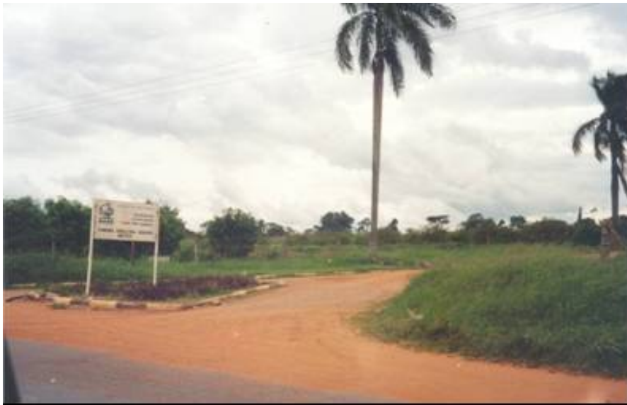
Entrance to KARI 9 km Kampala – Gulu Highway

Kawanda Agricultural Research Institute (KARI) is a subsidiary of the National Agricultural Research Organisation (NARO) and is found in Nabweru Sub-county of Wakiso District. The institute is to the North of Kampala in one of the peri-urban areas, which is about 9 kilometres from the capital City of Uganda. It is located at about longitude 45°N and latitude 48°E on a raised ground but steadily sloping to the south and west of the institute where it is partly bordered by swampy wetlands. The west of the institute is also bordered by human settlements where the neighbouring communities predominantly practice subsistence agricultural activities; including animal husbandry. To the east, the institute borders with the Gulu highway while to the North and to the North West it borders with business centres with a number of small scale business activities being carried out by the local communities. The site has a land cover that can be approximated to two (2) square kilometre most of which is covered by a number of agricultural demonstration plots.