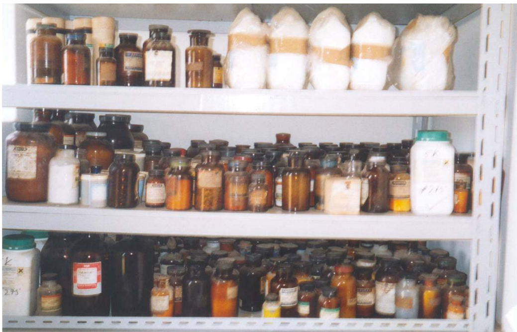
Obsolete Laboratory Chemicals