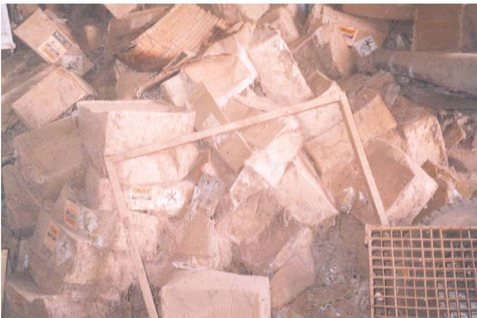
Rodent Poison that has been stored for over 30 years

chemicals in the stores will eventually mix up to form new compounds that would probably be more toxic.