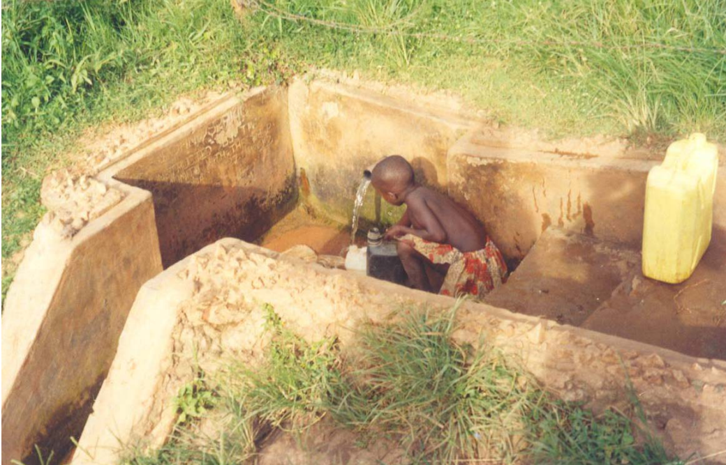
A protected well for the communities near the KARI establishment

The majority of the population living in surrounding areas to the KARI establishment do not have access to piped water and depend on protected springs. Being that KARI stands on a raised ground, some protected springs drain their water from the KARI establishment. Little information however is available on the water quality from these springs. However, the communities interviewed from the area indicated that they had not experienced any chemical related health problems emanating from the water although, it would be difficult for most of these communities to distinguish common diseases from chemical related ailments.