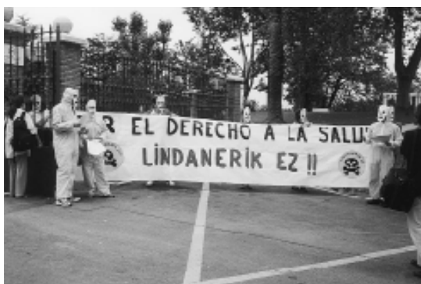
Figure 7: Protesters outside the 5th HCH and Pesticides Forum in Bilbao, Spain campaigning against lindane