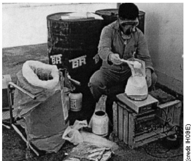
Figure 6 : Brazilian sprayman handling insecticides

Occupational exposure to lindane occurs either on-farm or at commercial seed treatment facilities and involve farmers or workers who mix, load and/or apply lindane as a seed treatment, and persons who handle or plant treated seed. 26 In developing countries, pesticide handling during manufacturing, packaging, transportation and application are of major concern due lack of proper guidelines and weak enforcement of pesticide regulations.