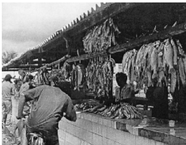
Figure 4 :Fish collected from rivers are the main source of protein for the riverine population but also are factor of human exposure to pesticides

Most human exposure to lindane is from eating food contaminated with the pesticide. The international authority on food residues, Codex Alimentarius, has set the Acceptable Daily Intake (ADI) for lindane at 0.001 mg/kg of body weight. According to this standard, the maximum daily dose for a 60 kg adult should not exceed 0.06 mg. The ADI was changed in 1997 from a previously less stringent figure of 0.008 mg/kg.