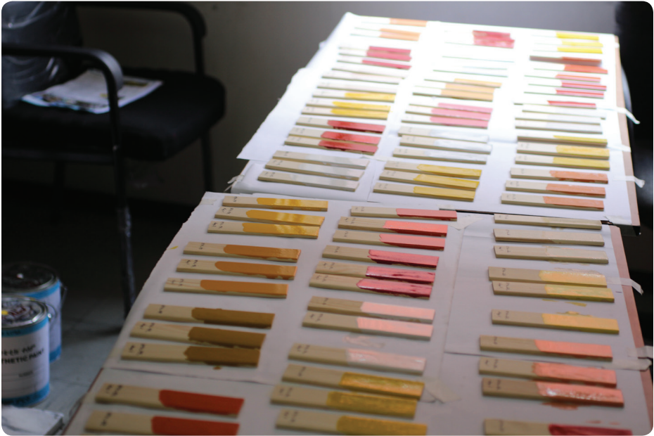
Figure 3. Paints included in the study.