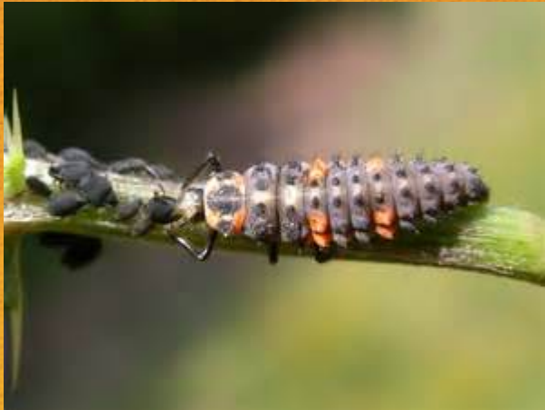
Lady bird larva eating aphids

Goal 2: “..achieve food security ... promote sustainable agriculture”