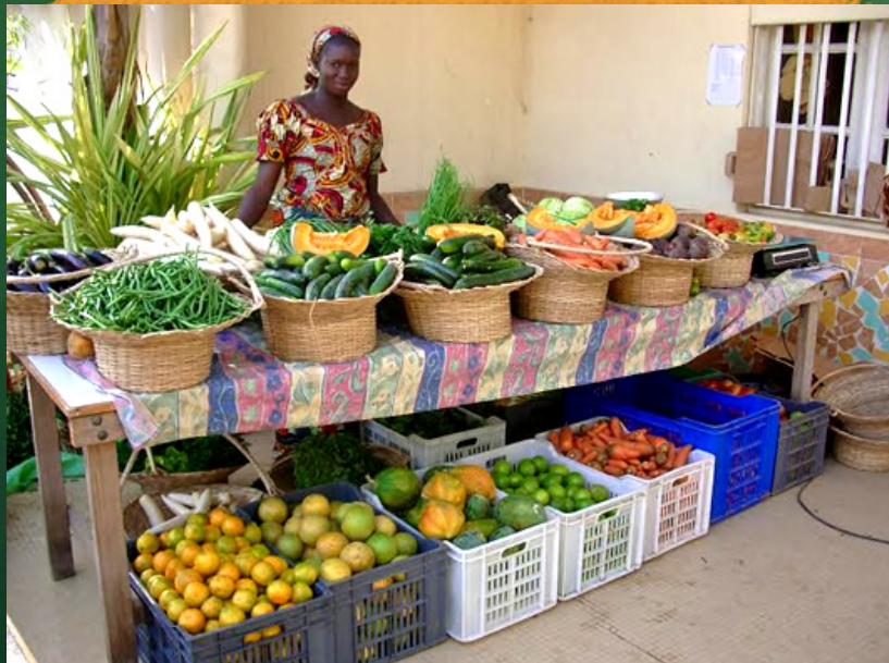
Organic vegetables in a market in Senegal