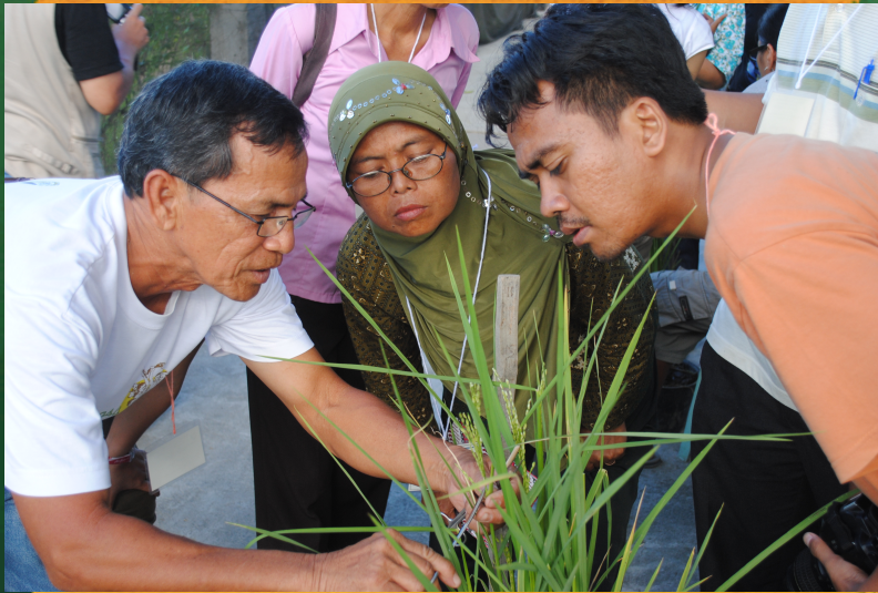
Farmer-to-farmer transmission of knowledge - rice breeding in the Philippines