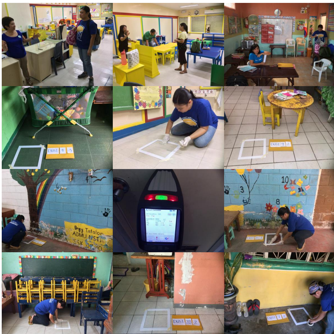
Figure 1. Collection of Floor Dust Wipe Samples at Different Locations.

This study was undertaken to highlight the presence of high levels of lead in household dust and the associated health hazards. In order to be able to compare the results from the study with recommendations, previous published data, and information about hazardous levels of lead in household dust, the dust wipe method described by the U.S. Department of Housing and Urban Development (HUD) was followed (HUD, 2012). In addition, results from dust wipe analyses have been shown to correlate with children's blood lead level (Gulson, et al., 2013). The laboratory performing the analyses is accredited for performing lead dust analyses, and the detailed method is described in Appendix 1. A total of 12 private homes, 5 day-care centers and 4 preparatory schools were sampled for this study. Collection of dust wipe samples at different locations is shown in Figure 1.