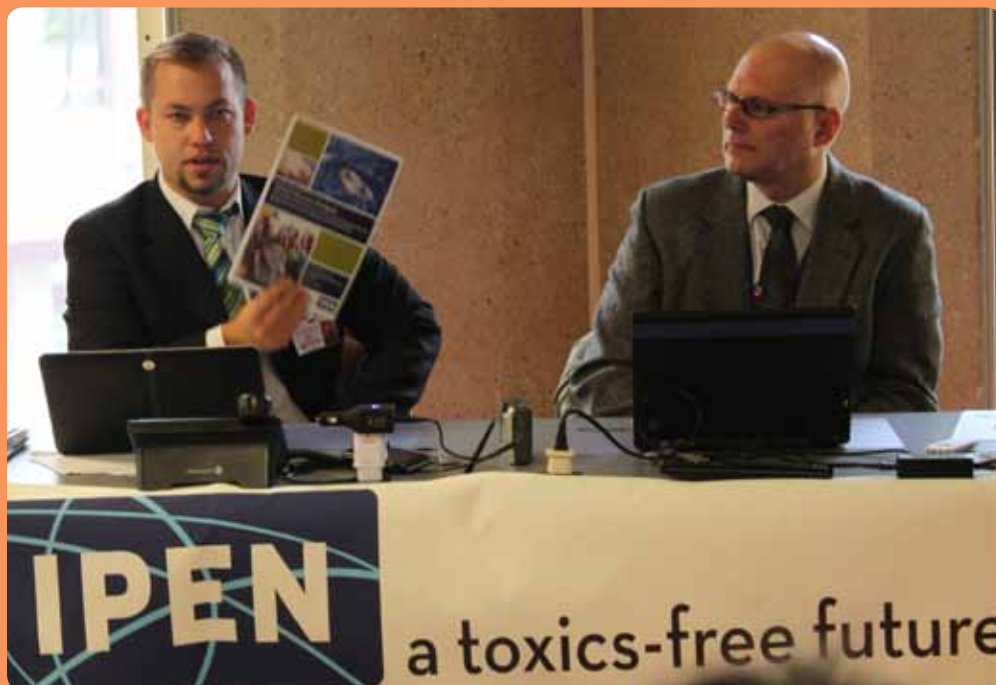
IPEN interventions and media campaigns helped strengthen the Mercury Treaty

A final IPEN press conference offered an analysis of the new treaty’s strengths and weaknesses and resulted in stories around the world, including in stories by Associated Press, Reuters, BNA/Bloomberg News, Agence France Presse, Le-Monde, RIA Novosti (Russian international news agency), EFE (Spanish international news agency), and Inter-Press News Agency.