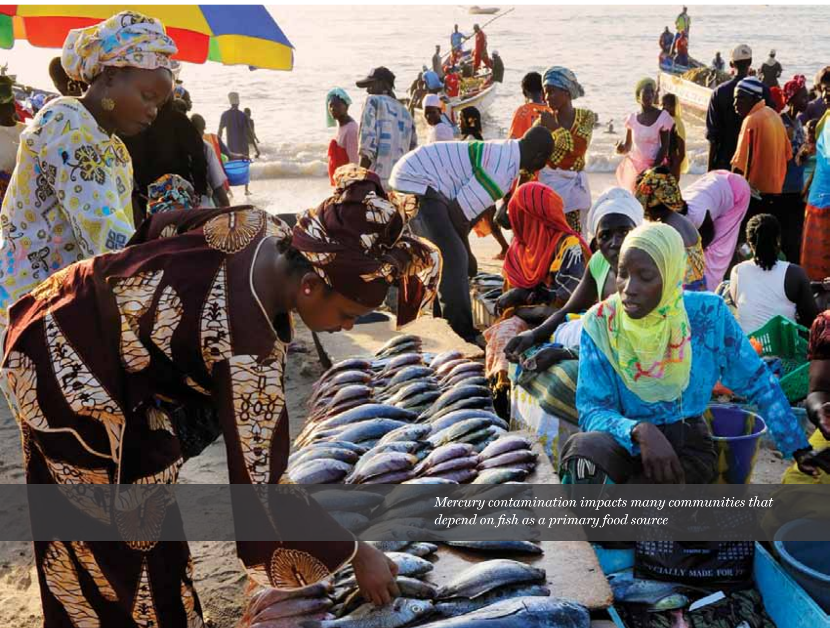
Mercury contamination impacts many communities that depend on fish as a primary food source

Lead. Decorative paints containing hazardous levels of lead are still widely sold in most developing countries, long after bans in industrialized countries. Evidence of reduced intelligence caused by childhood exposure to lead has led the World Health Organization to list “lead caused mental retardation” as a recognized disease.