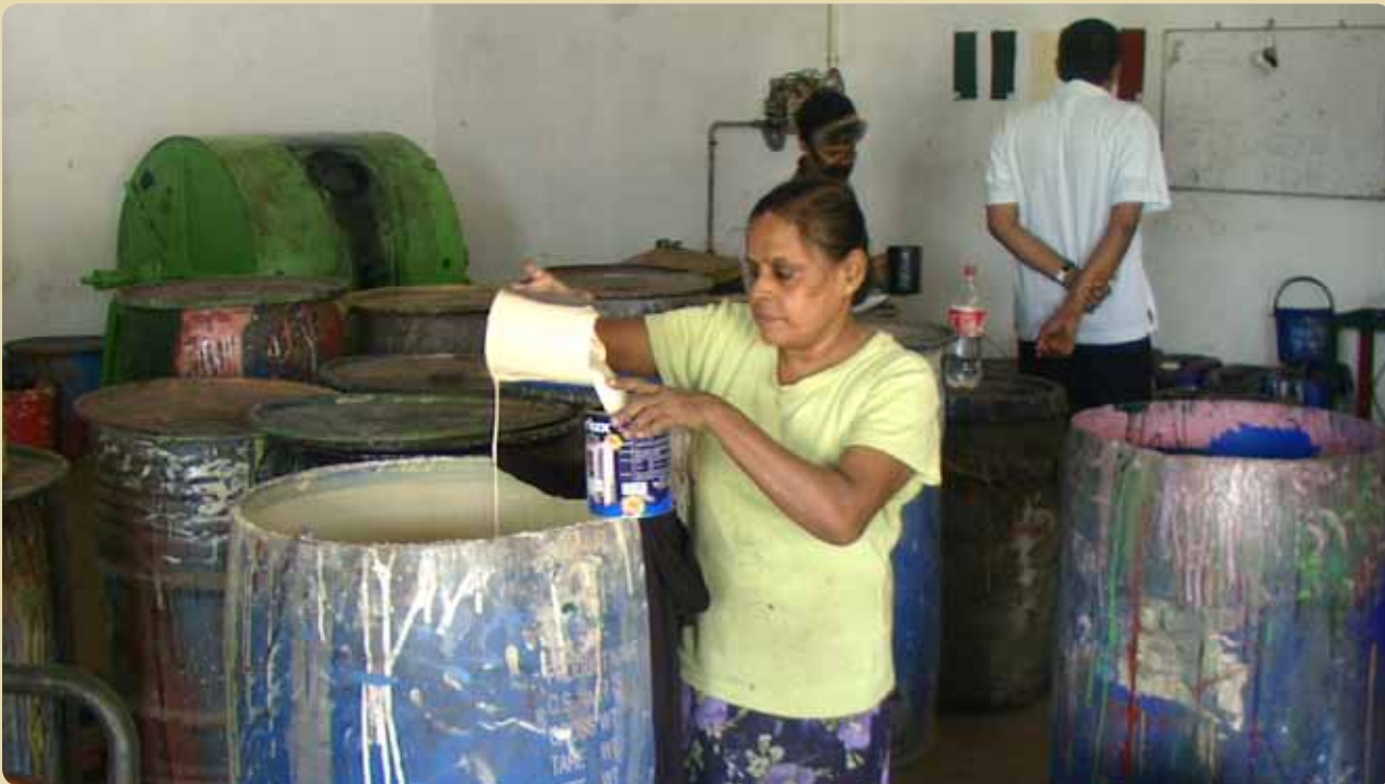
Sri Lanka is one of only a handful of developing countries that bans dangerous levels of lead in paint

As a part of the IPEN Asian Lead Paint Elimination Project, CEJ conducted a second round of paint testing in the spring of 2013. This study found that the percentage of samples with concentrations above the legal limit had decreased. Companies that had participated in awareness-raising activities conducted by CEJ after the 2009 study had reduced their lead levels.