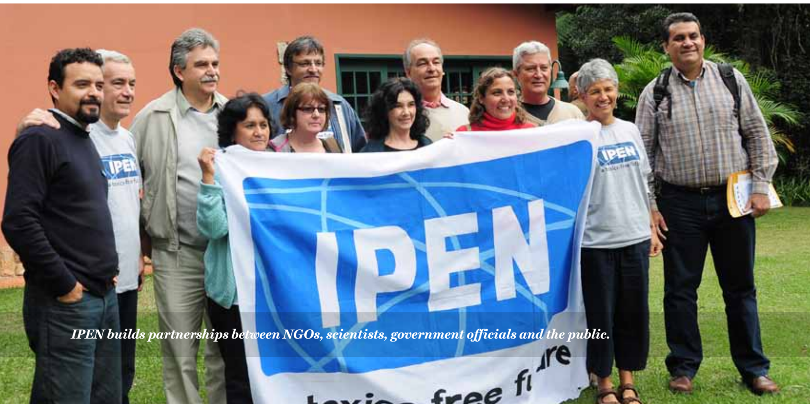
IPEN builds partnerships between NGOs, scientists, government officials and the public.