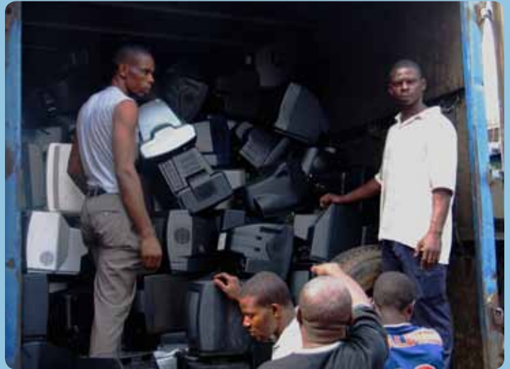
IPEN helped close a loophole that would have allowed recycling of dangerous flame retardants.

In a subsequent, similar battle over another flame retardant, HBCD, advocacy by IPEN and its allies helped secure a requirement that new building insulation containing HBCD be labelled. This is the first time the Convention has required labelling of a material containing a POP.