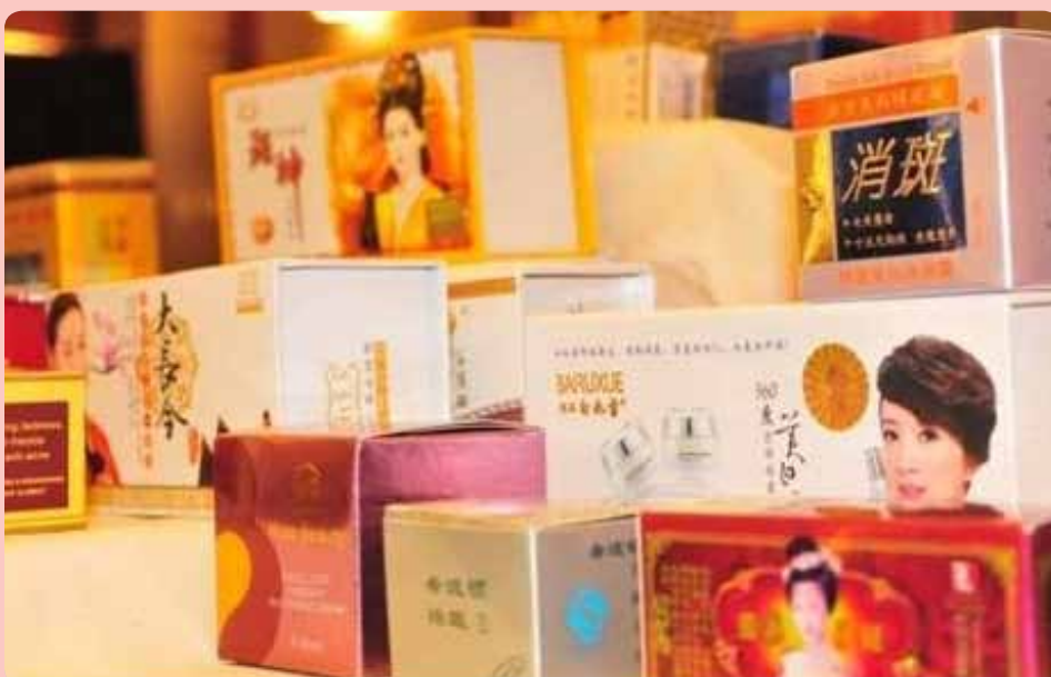
Taobao, China's largest online retailer, removed skin whitening products containing mercury, in response to a campaign waged by Chinese NGOs

In 2012 IPEN, along with Green Beagle and Global Village of Beijing, secured a two-year, €300,000 grant from the European Union's European Aid Agency to build NGO capacity and advance policies related to chemical pollution and impacted communities in China.