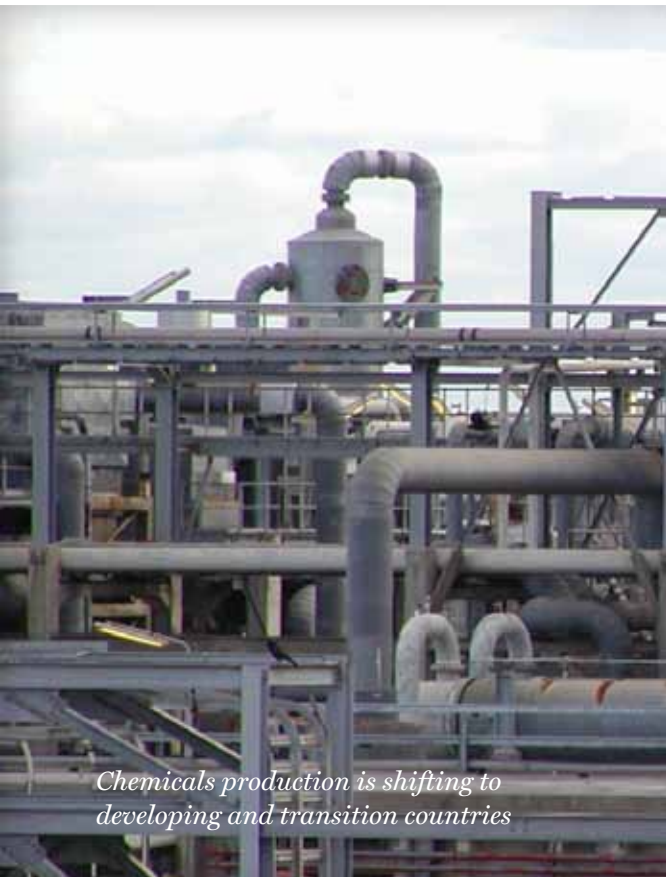
Chemicals production is shifting to developing and transition countries