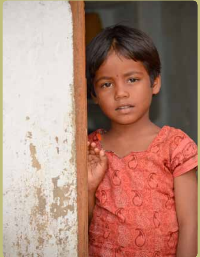
Paint with high levels of lead is sold widely in developing countries.