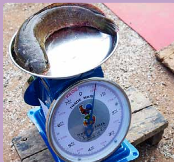
Hair and fish samples taken by IPEN show high levels of mercury in fishing communities.