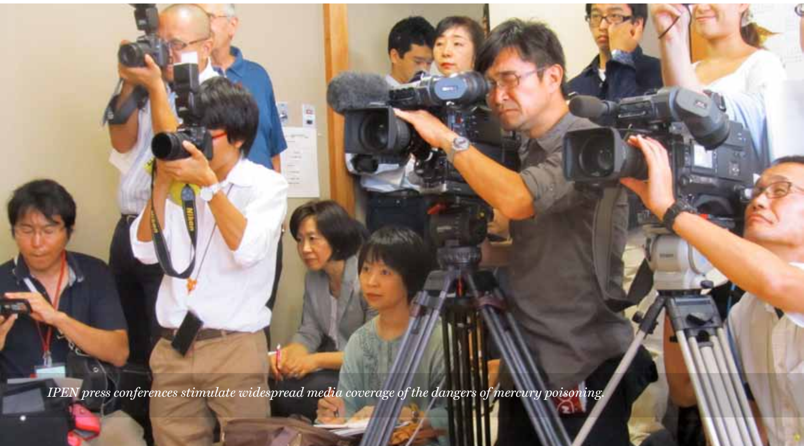
IPEN press conferences stimulate widespread media coverage of the dangers of mercury poisoning.