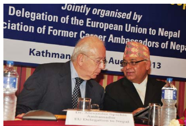
Former EU Ambassador Dr. Alexander Spachis with Foreign Minister Ghimire at the EU-AFCAN seminar

the EU diplomats, incumbent and former Nepali diplomats and government officials including people representing the trade and economic sector. Five papers were presented at the symposium: 'EU's Cooperation on Nepal's Development', 'EU Investment in Nepal', 'EU-Nepal Trade, Problems and Prospects', 'EU-SAARC Relations' and 'The Role of the European Union in the Promotion of Democracy, Human Rights and 'Electoral Process in Nepal'.