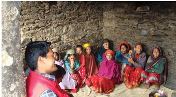
Haliya Women sharing their sufferings despite the announcement of their liberation six years back. The EU funded project being implemented together with CARE Denmark and Rastriya Haliya Mukti Samaaj is supporting the revision of government policies and laws so that they can guarantee the rights of the Haliya communities