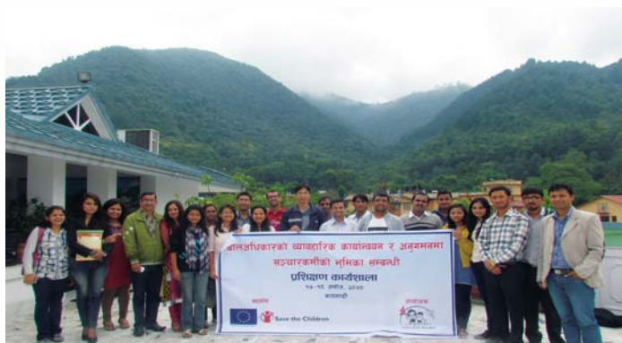
Participants of the media training on child rights organised in Godavari posing for a photo. Save The Children along with National Coalition for Children as Zone of Peace and Child Protection (CZOPP) organised the training for one of the EU-funded EIDHR projects.