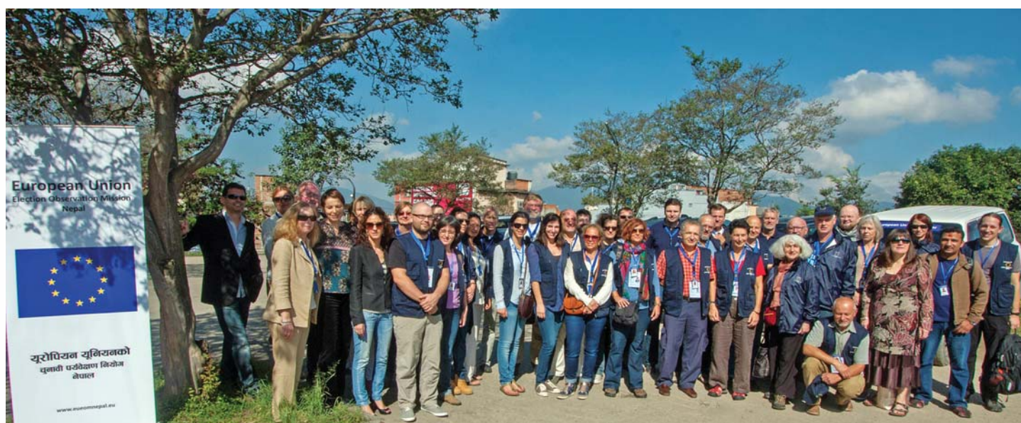
The members of the core team along with the long term observers pose for a photograph before setting out to different districts for observing the Constituent Assembly elections 2013.

EU election observers are bound by a strict code of conduct that ensures their neutrality and impartiality. They do not interfere in the electoral process and have no authority to change or correct any shortcomings or to request changes during the election process. The EU EOM will issue a preliminary statement shortly after the elections. A final report - with technical recommendations for future elections - will be published later. Since 2000, the EU has deployed 78 missions involving the participation of over 10,000 persons. Various types of observers participate in the European Union's Election Observer Missions (EOMs).