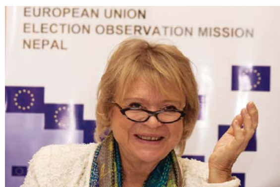
Chief Election Observer Eva Joly

Shortly before elections, a group of 40 Short-Term Observers together with a Delegation of members of the European